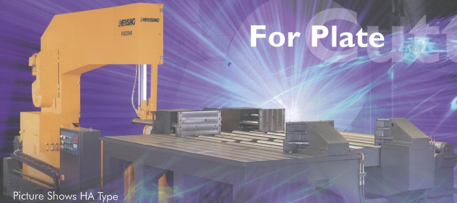
Picture Shows HA Type